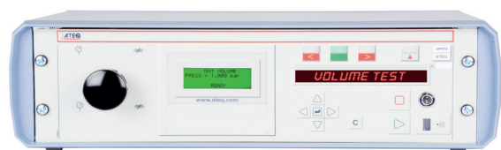
MF520 19"3U CASE