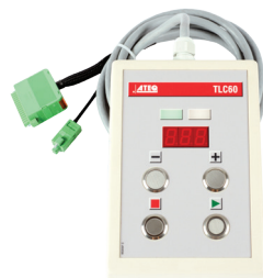
TLC 60 Remote control