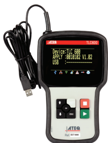
TLC 600 Remote control