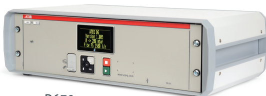
D670 19"3U case