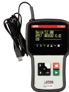
TLC 600 Remote control