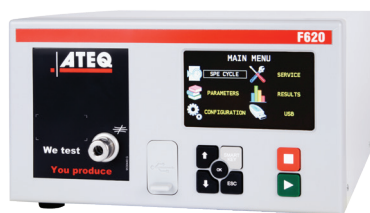
F620 leak tester