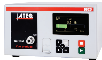
D620 Flow tester